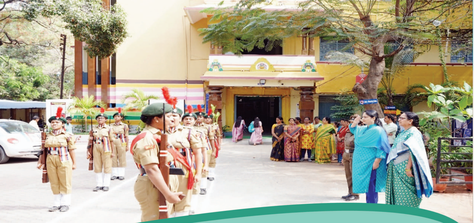
Guard of honour by NCC Students during NAAC Peer team visit