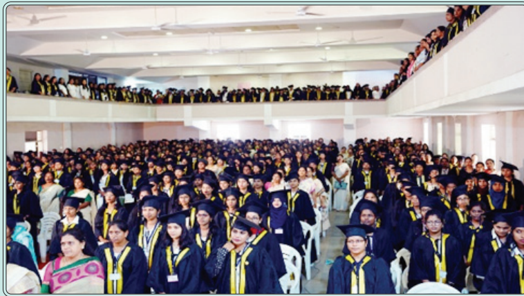
Graduation Day, 2023