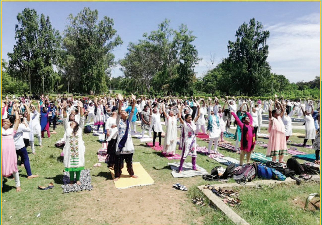
Celebration of International Yoga Day