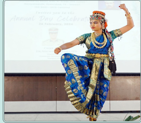
Students showcase their talents