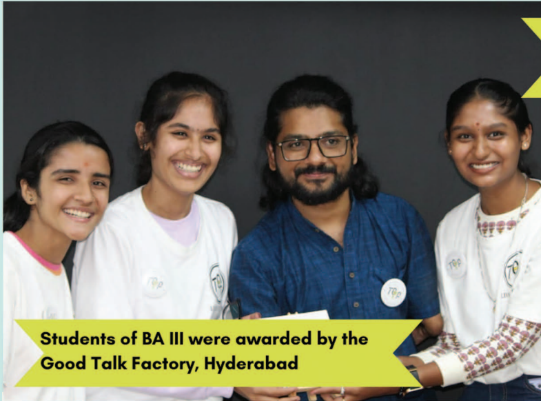
Students of BA III were awarded by the Good Talk Factory, Hyderabad